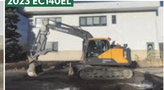
STOCK #12377 | 270 HOURS