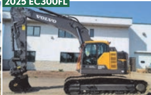
STOCK #13940 | 1,100 HOURS