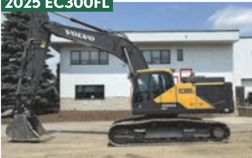
STOCK #14729 | 120 HOURS