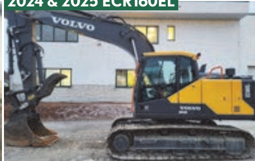
MULTIPLE IN STOCK