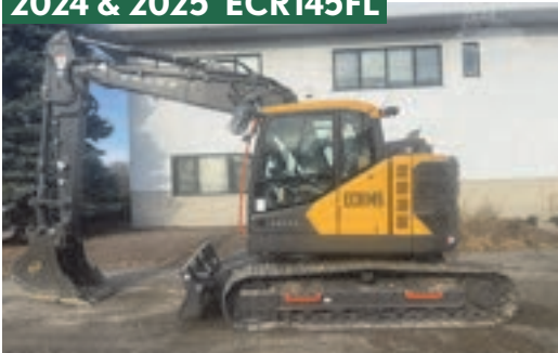
MULTIPLE IN STOCK