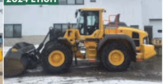
STOCK #14245 | 400 HOURS