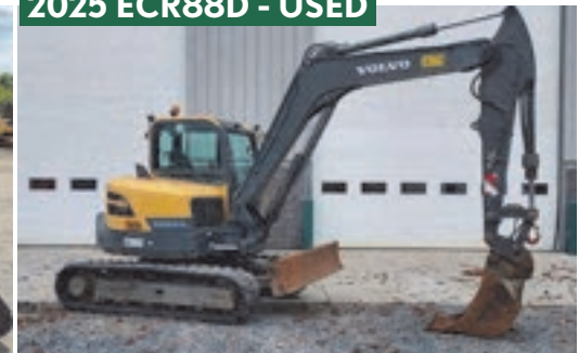
STOCK #14092 | 5,300 HOURS