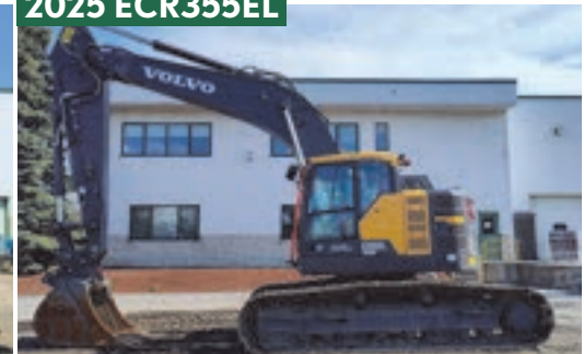
STOCK #14269 | 360 HOURS