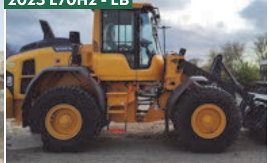
STOCK #13895 | 1,000 HOURS