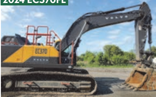
STOCK #13939 | 600 HOURS